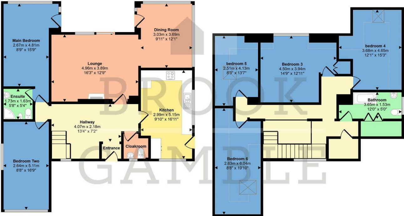
Ground Floor Approx 98 sq m / 1053 sq ft

Approx Gross Internal Area 185 sq m / 1993 sq ft